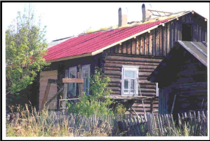
One side of the new roof almost completed.