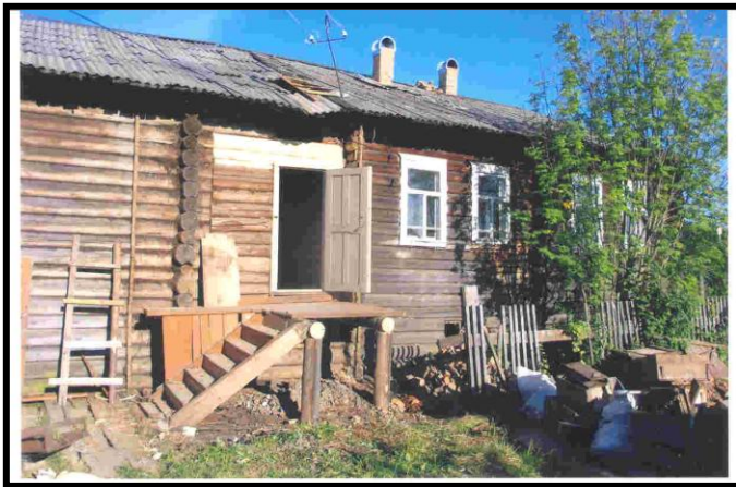
A “before” picture of the outside entrance to the new church. How many differences can you spot?