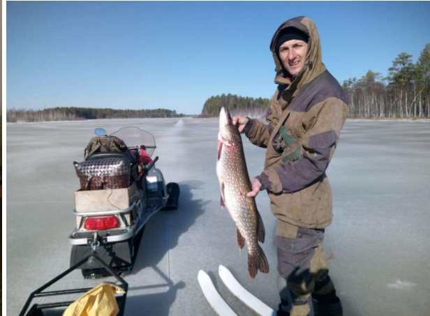
Still ice on the water near Don in late April