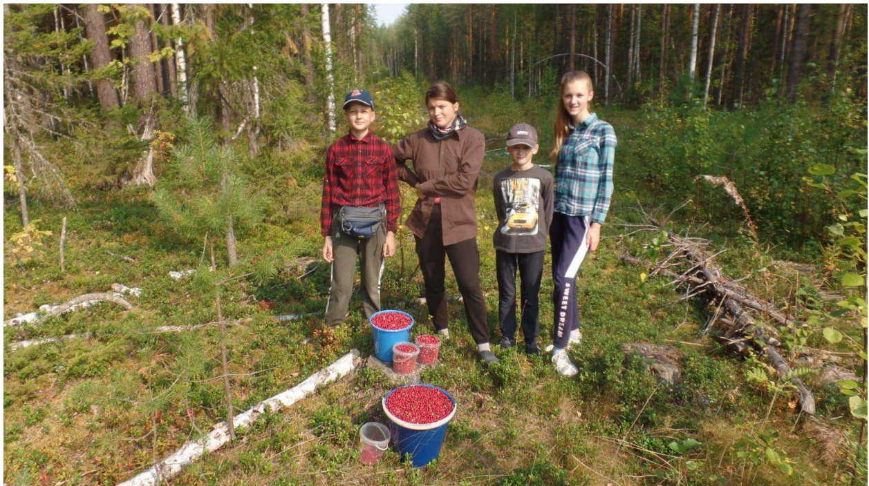
The Guytar family picking berries in the forest this spring.